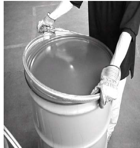
Figure 7 – Expanded ring being placed on drum