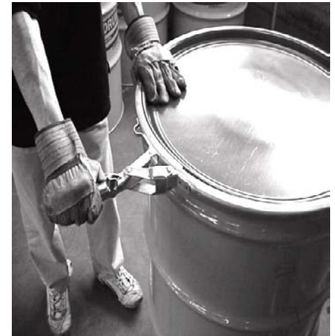
Figure 8 - Lever being closed slowly